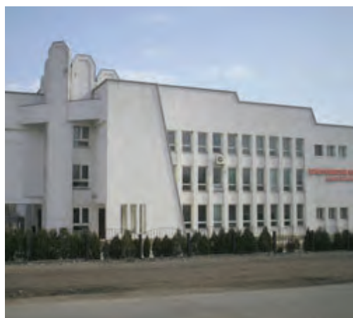
Further right: Ukrainian team visiting Minsk, Belarus. March 2014.