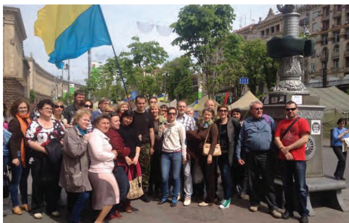
Left: Ukrainian team and students visit Kiev. April 2014.

It is also emotionally difficult for us as Regional Directors. For twenty years we have taught and ministered all across Ukraine and Russia. We love the people, and we love the places. It is hard to see the suffering and deception.