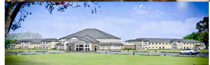
Artist Rendering of Future Center

Bring Ellel Ministries weekend teachings to your congregation. Find out how by calling the center.