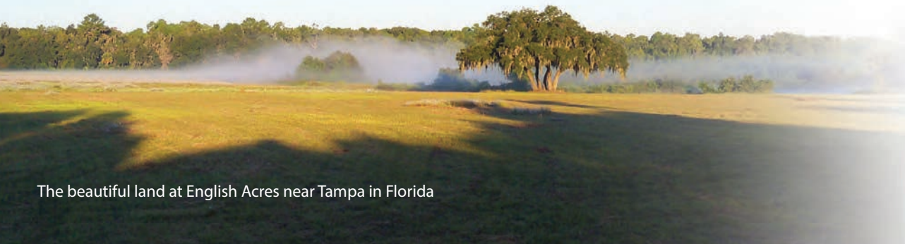
The beautiful land at English Acres near Tampa in Florida