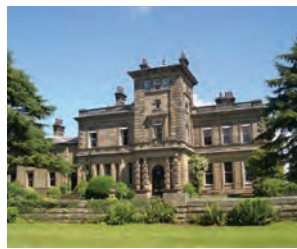
Ellel Grange - HQ of Ellel

What we do is summed up in the phrase ' Bringing the heart of God to the heart of man ' and Luke 9:11 where Jesus welcomed the people, taught them about the Kingdom of God and healed those who were in need. Ellel Ministries is now in its 31 st year and is established in over 40 countries around the world including the USA.