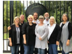
Ellel USA Ministry Team